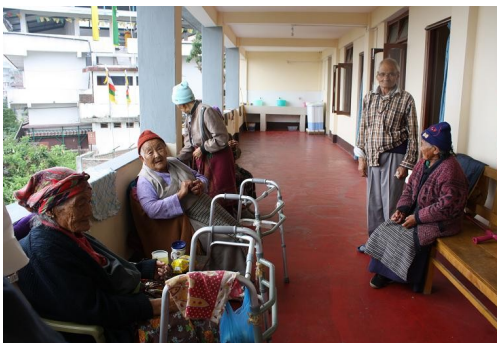
At Kalimpong old people's home, Sikkim.