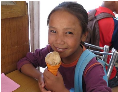
Their first ice-cream ever!

We then go to the ice-cream parlour and order chocolate ice-creams for all the children.