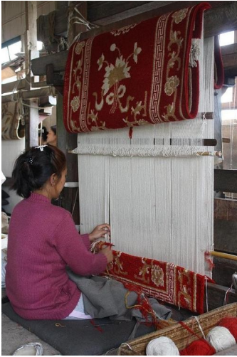
At the refugee centre in Darjeeling