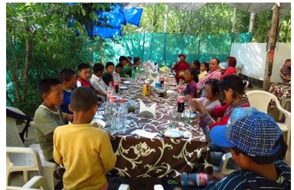
The nicest table!