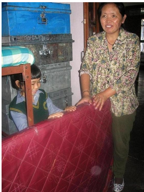
New mattresses for TCV Suja