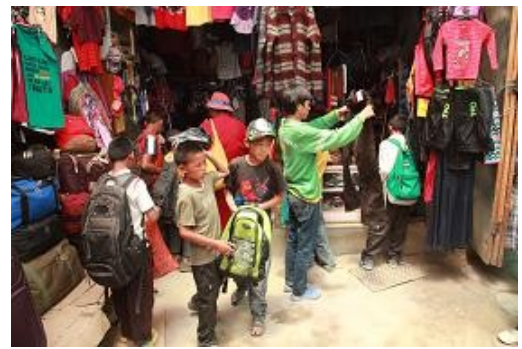
Some very tempting backpacks !

After the market, Ani la takes us, walking in single file, to a wholesaler's where socks are at a rock-bottom price, but there are also nice, inexpensive T-shirts and tracksuits. The last rupees are spent and we add some if needed. But none of them take advantage of the situation.