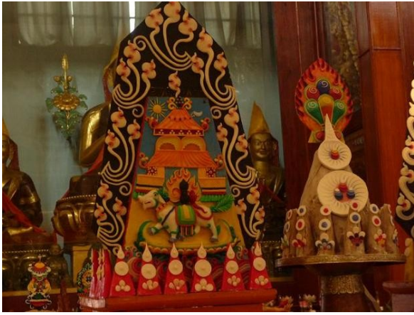
Offerings for Losar