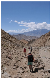
Going straight to Sabu under blazing sun!