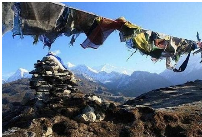
View of Mount Kanchenjunga

And when the altitude is such that nothing can grow, the flowers are replaced by snow-capped mountains, breath-taking summits, lakes, animals such as blue sheep, antelopes, yaks, and birds as multi-coloured as flowers and we meet other trekkers with whom we make friends.. Of course we occasionally encounter some difficulties but they are quickly overcome.