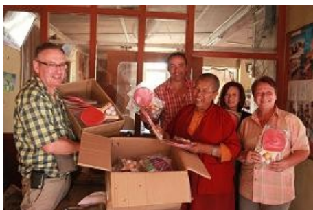
A downpour of table tennis bats!