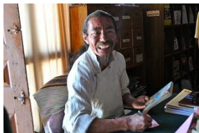
The librarian is Tibetan.