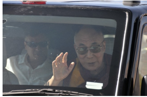
HH Dalai-Lama's visit: a shower of blessings !