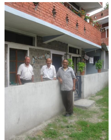
In Parabling, roads and paths full of potholes.