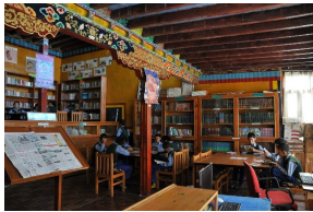
Hard-working students in the library.