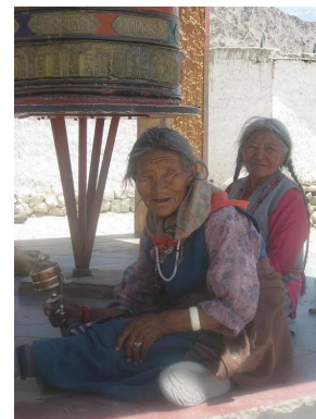
Two old-age ladies in Agling refugee camp (Ladakh)

I was present at such a distribution on the morning of July 17 th , and Mr Tenzin Rabten asked me to take photos to be sent to the old people's sponsors the following winter. As many of them are unable to read and write, they have to leave their thumbprints as signatures. Younger handi-capped or retarded adults, who are unable to earn a living, are also included in this category. When I was in Agling with Mr Rabten-la, some TCV secre-taries had also accomplished the same task in other areas around Choglamsar. As for those who did not arrive in time, they can always come to the TCV Choglamsar and settle the situation later.