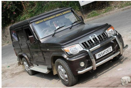
In Ravangla, this jeep was financed by AET