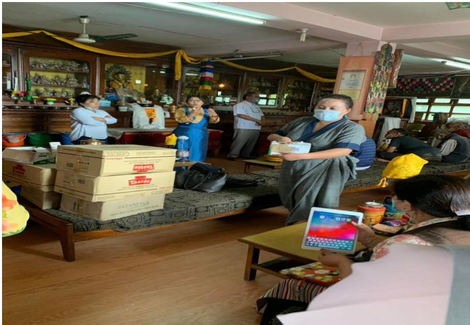
Doctor from Phende