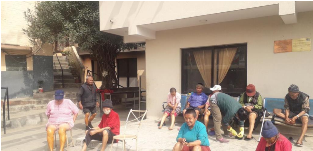
Elderlies were provided with new clothes for Tibetan Losar: